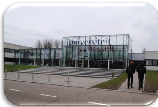
Main Building D

Since 1973 Hasselt University is located on the Campus Diepenbeek, which occupies an attractive 150 acre site in the middle of Limburg's green belt. It is 2 kms west of the town centre of Diepenbeek, a residential town of 17717 inhabitants, and 4 kms east of Hasselt which has a population of about 69529 and is the administrative and commercial centre of the province. Brussels is 90 kms away (to the South-West).